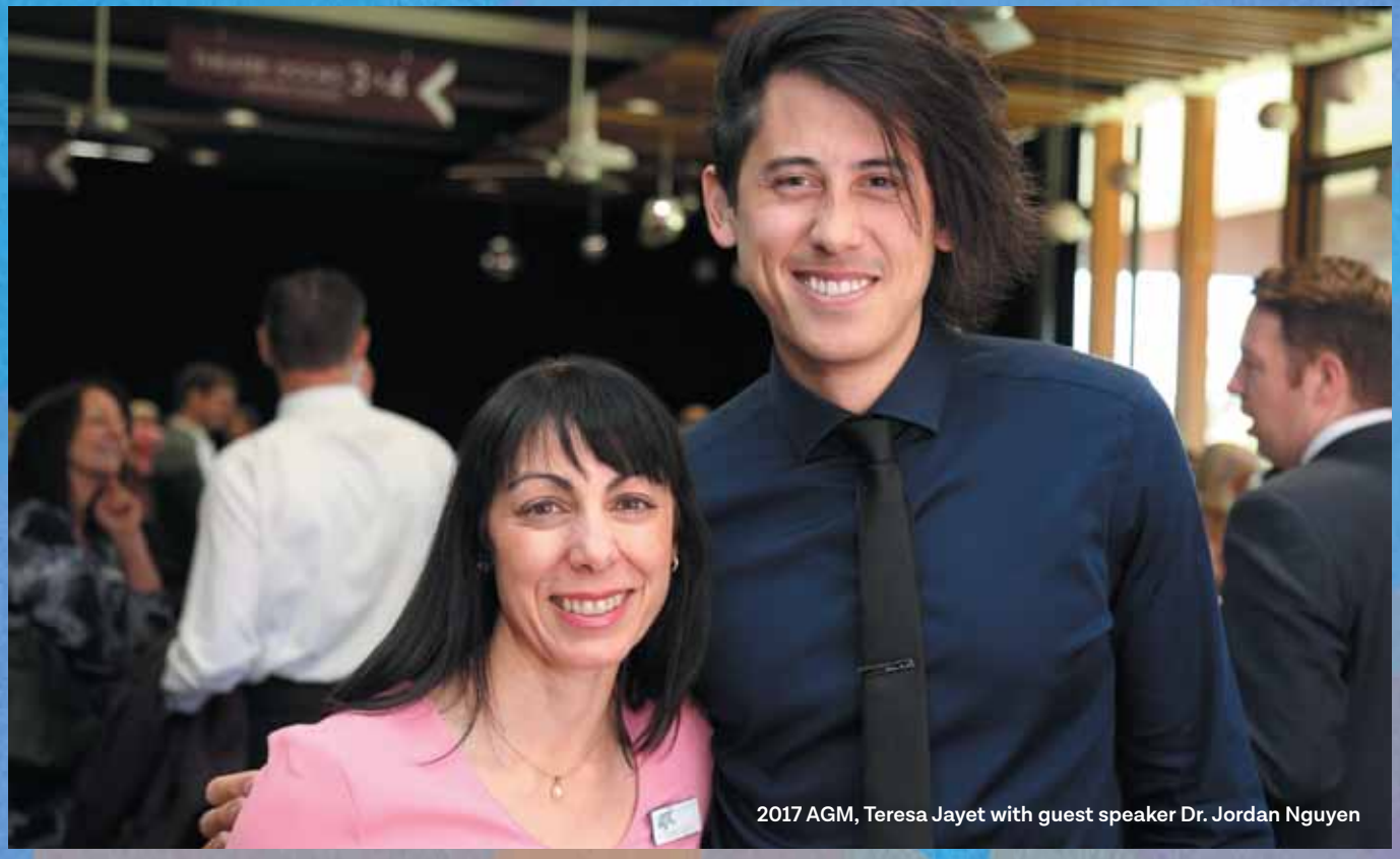
Years of Service Recognition